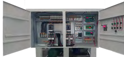
OEM, Saudi Arabia