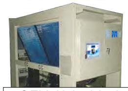
OEM, United Arab Emirates