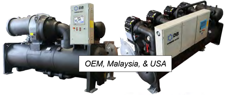
OEM, Malaysia, & USA

Industrial Control Panel Custom built by MCK using MCS Controls